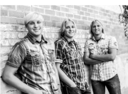
Long Time Coming of Eupora, MS

Saturday, February 6 th 6:30 p.m. First Baptist Church, Eupora