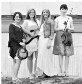
Grass Skirts of Fulton, MS